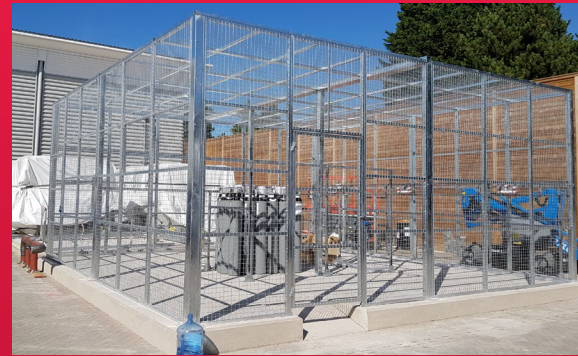
Cage Fitted & Issue resolved

Thanks for all your help in solving a major COSHH storage issue in a professional way.