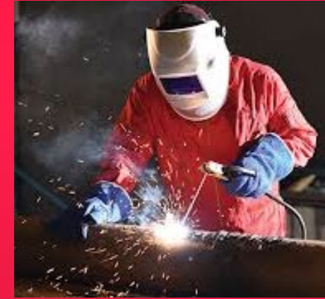
Quality Assured Manufacture & Supply