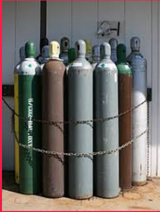
Customer Storage issue